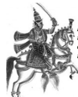
Nirriti, the goddess of destruction in brahmanism